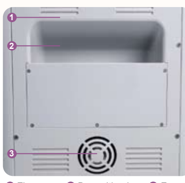
1 Fix cover 2 Depositing box 3 Fan