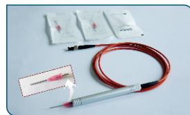
Surger Handpiece With Disposable Tips