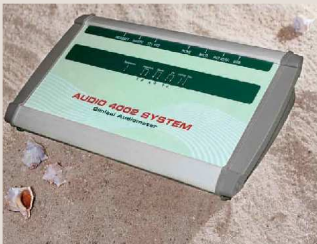
Audio 4002 System

We recommend also our other available products: